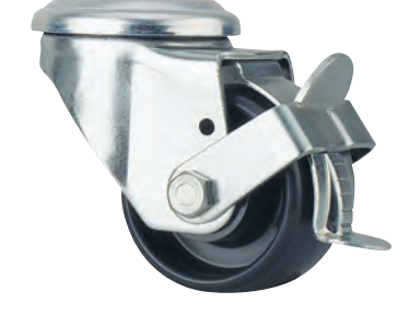
Top plate style swivel caster shown with Step-Down Brake engaged on black nylon wheel.