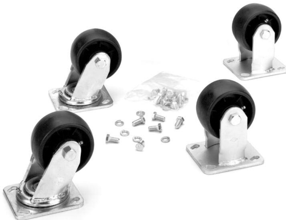
Complete kit includes two swivel and two rigid casters with polypropylene wheels in 4", 5" or 6" diameters, plus 16 attaching bolts and lock washers.