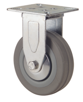
TSED 050 & 075 top plates have fixing holes to fit 1/4" diameter bolts and are slotted from 1-1/2" to 1-7/8".