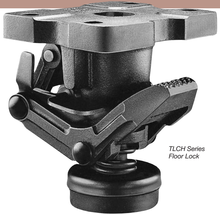
TLCH Series Floor Lock

The TLCHR model features a longer and wider engagement pedal so that the unit is safer and easier to step down and lock into position. It also has a thicker rubber mounting pad attached to the unit with a heavy-duty threaded bolt for added strength and easier replacement of the pad.