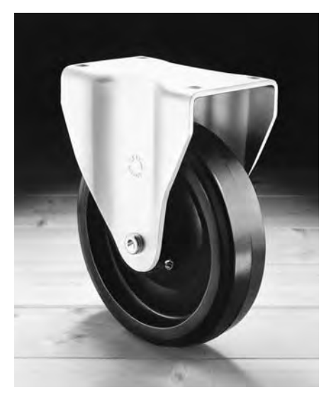
88 Series Fixed