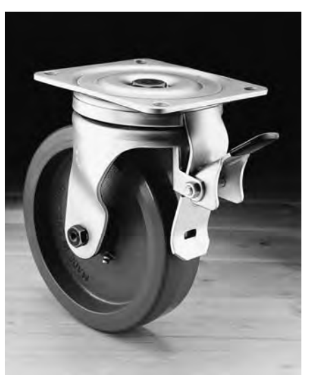
55 Series Swivel & Wheel Brake

A combined swivel and wheel brake is available for the 55 Series caster with a roller bearing and a Rubber-on-Cast-Iron or a Polyurethane-on-Cast-Iron wheel. The swivel radius is increased to approximately 6-3/16". To order, add suffix SWB to the Swivel Part #.