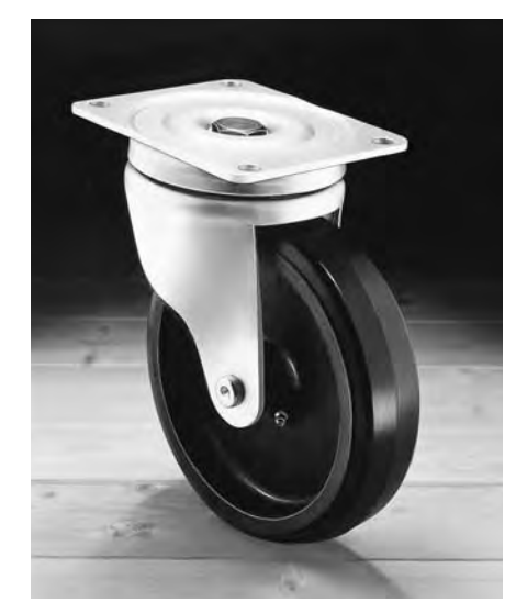
55 Series Swivel