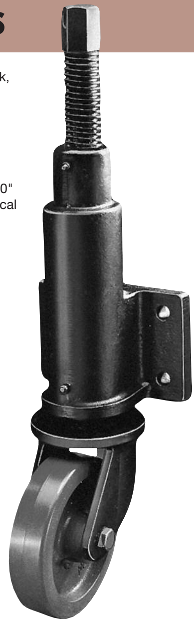
JA Series with 3" Lift

A = Wheel Diameter B = Overall Height C = Swivel Radius D = Tread Width