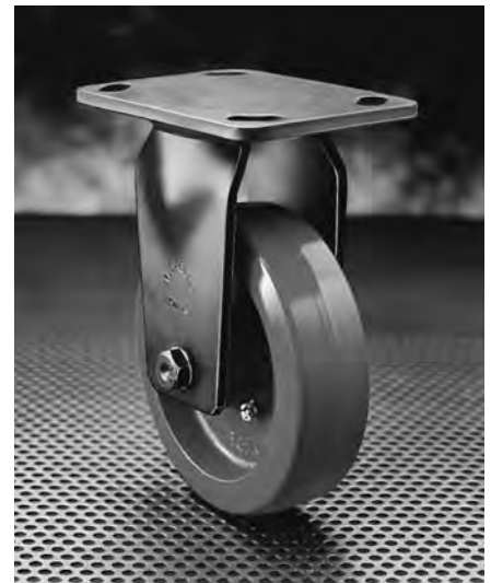
GTF Series Fixed