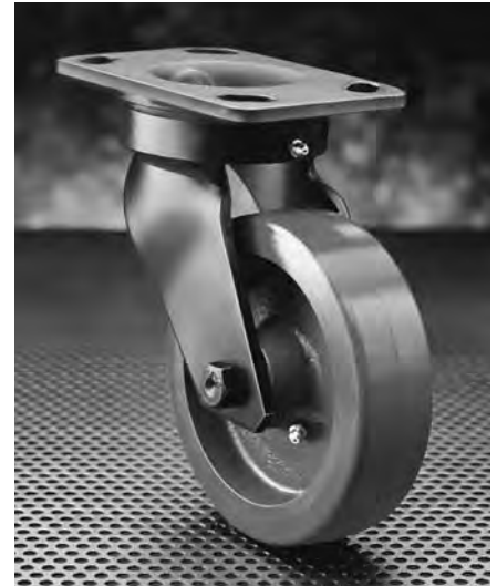
GT Series Swivel