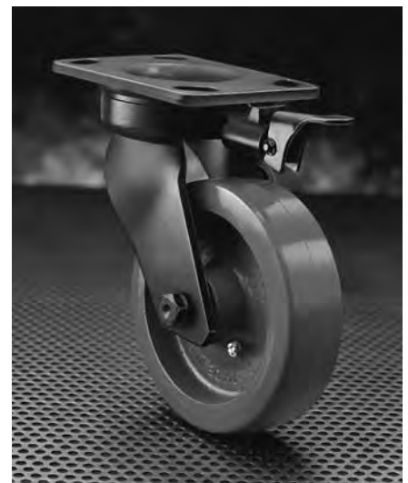
GT Series 2-Way Directional Lock