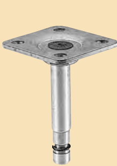
Square top plate and pin

To order a 5" TravelAid with gray rubber wheels and gray nylon center with a square plate, the order codes are as follows: 1232040, 1234010, 1288888.