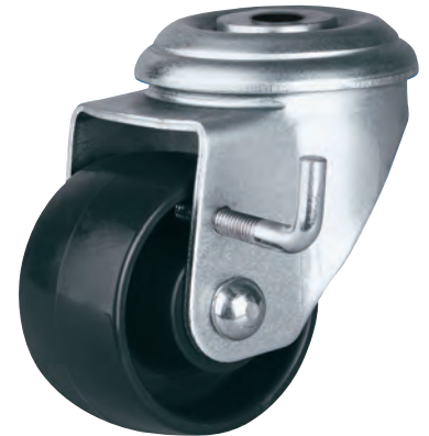
Bolt hole style swivel caster shown with Step-Down Brake disengaged.