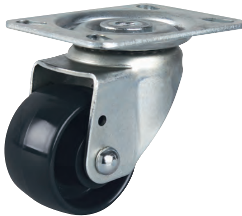
Top plate style swivel caster shown with Step-Down Brake engaged on black nylon wheel.

Sussex 63 bolt hole frames have a mounting center hole of 7/16".