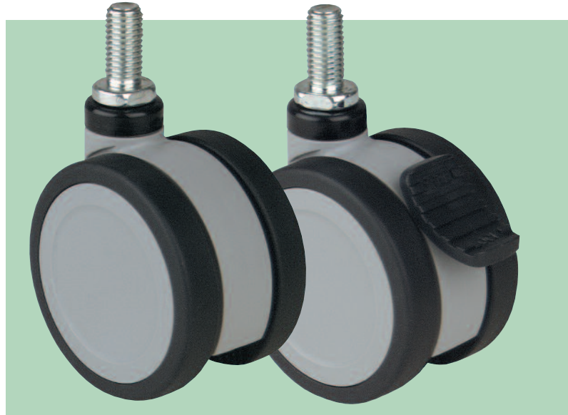
Available with a Total Stop brake, F Series swivel casters are an attractive, low-cost OEM design option.

3" top plates have fixing holes to suit 8.5mm diameter bolts. 4" top plates have fixing holes to suit 9mm diameter bolts.