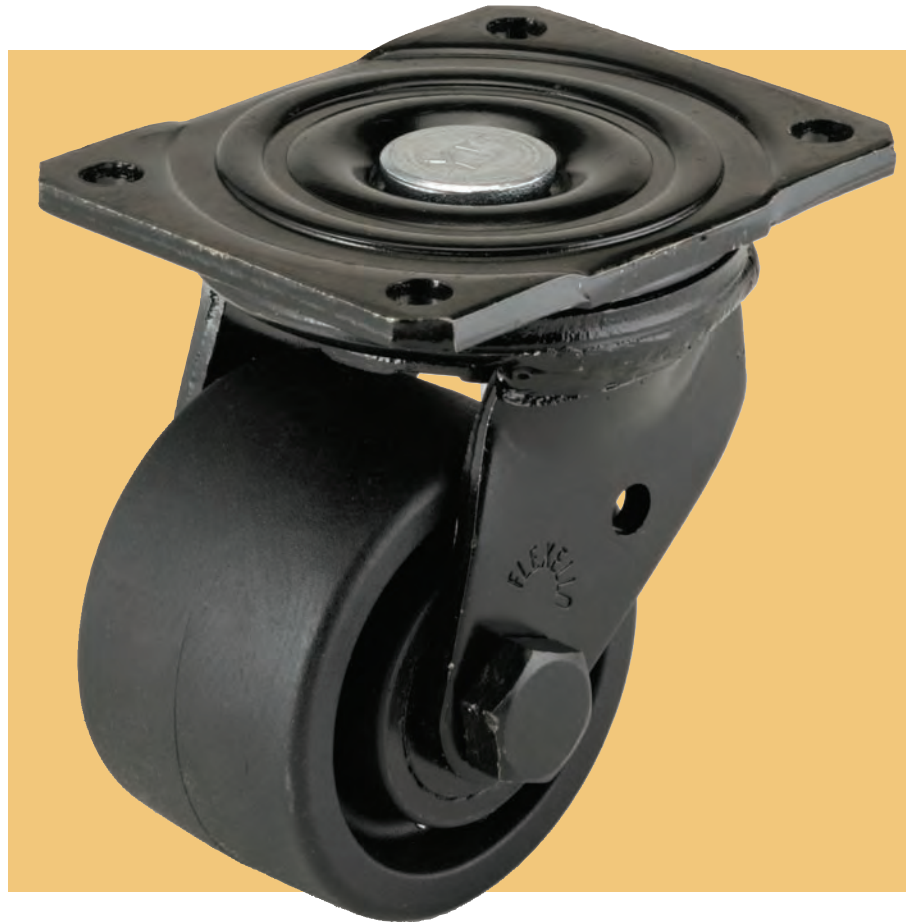
The new Revvo low-profile caster from Flexello features an attractive black powder-coated finish.

Top plates have fixing holes to suit 5/16" diameter bolts.